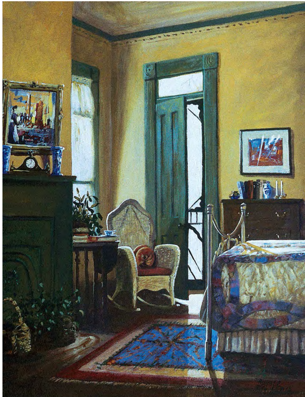
Reading Chair, Sims House

1996, acrylic, 18 x 14.