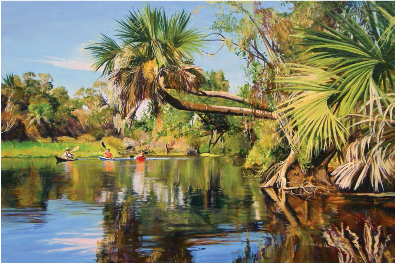
Rounding the Bend