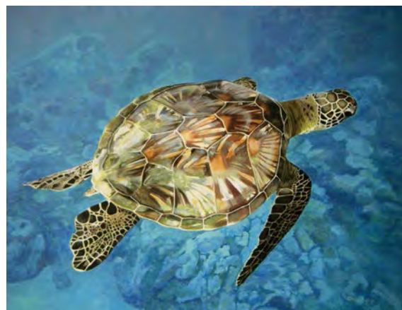
ABOVE Green Turtle 2008, acrylic, 33 x 42. Private collection.

Chupack sells her paintings through commercial galleries and her giclée prints on the internet. The prices for original paintings range from $500 to $900 for small (8”-x-10”), unframed canvases up to $7,000 for a 40”-x-60” unframed painting. Her prints sell from $40 for an 8”-x-10” image up to $250 for a 20”-x-30” print. Some of her prints have recently been published as part of fund-raising programs sponsored by environmental groups.