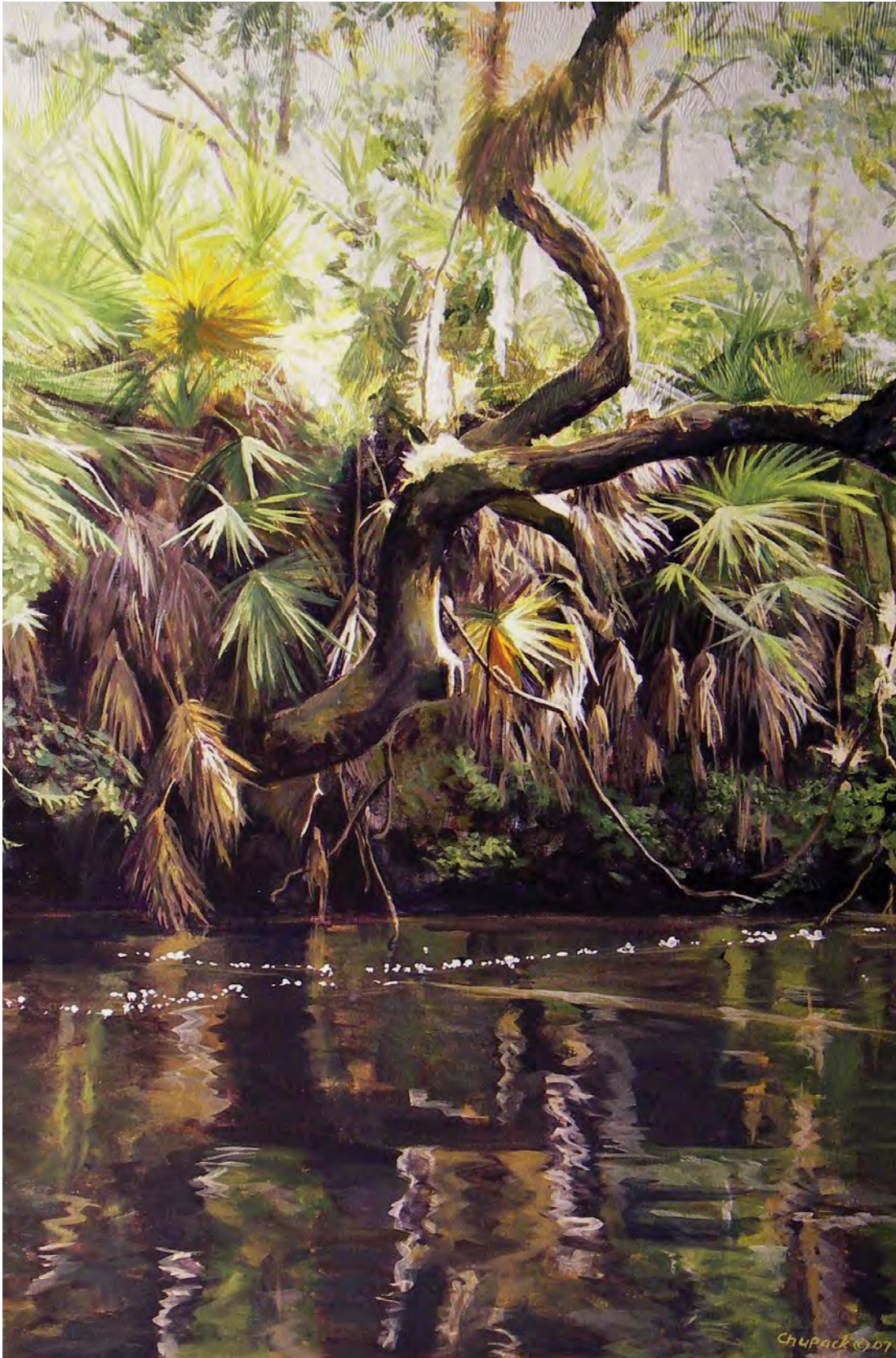
Telegraph Creek Oak 2008, acrylic, 30 x 20.